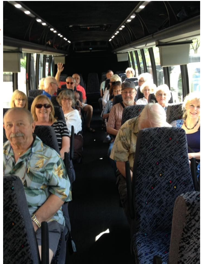
Bus loaded and ready to go to Amish Country

Did you know that the Amish only have a one piece curtain? It appears usually on one side of the window. It is thrifty, and identifies their homes as Amish.