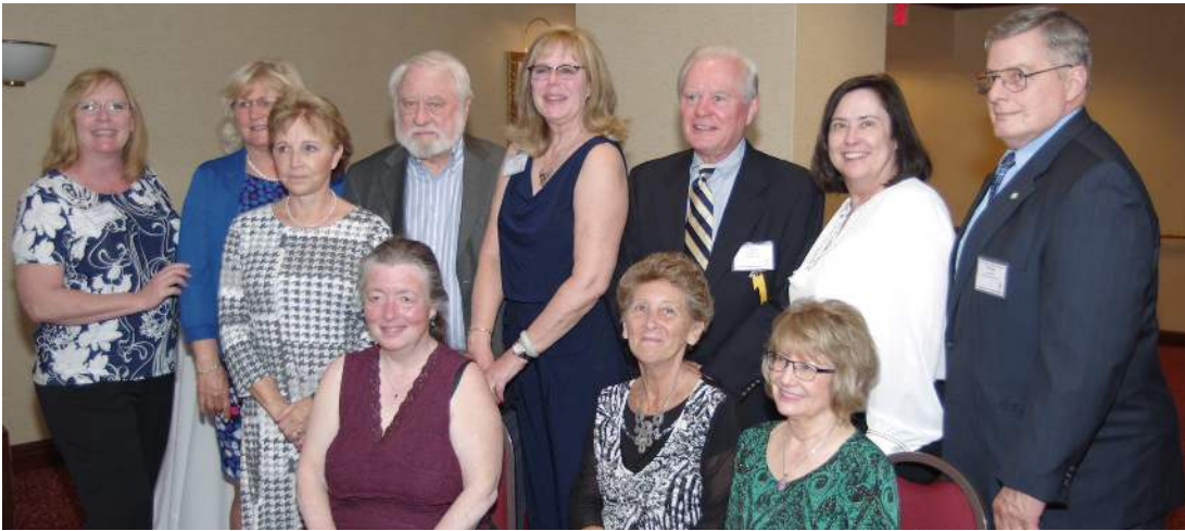
SPOUSES THAT ATTEND AND PUT UP WITH THE NONSENSE OF THE FRANKFURT EAGLES 1963—1966!