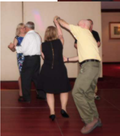
DANCING THE NIGHT AWAY TO A VERY GOOD DJ.