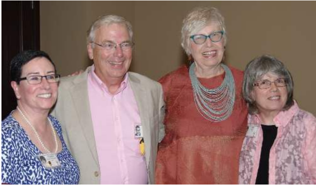
CLASS OF 63