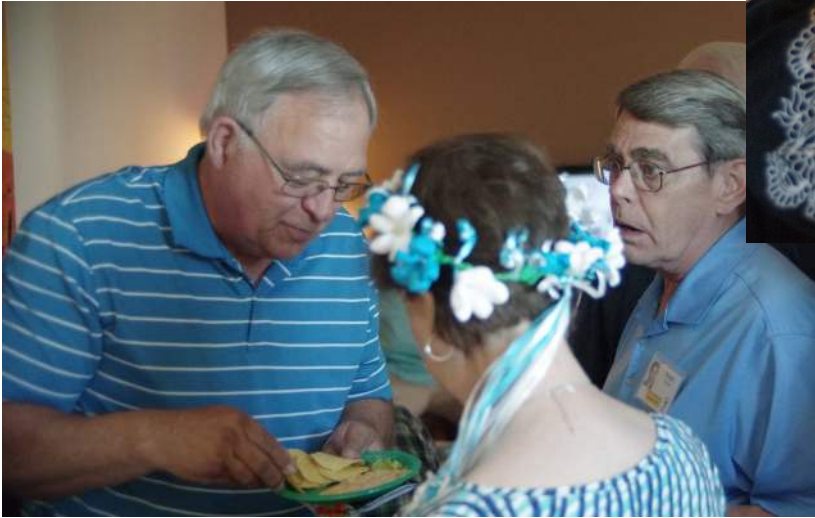
MARGARITA PARTY IN THE HOSPITALITY SUITE AFTER THE ROAD TRIP