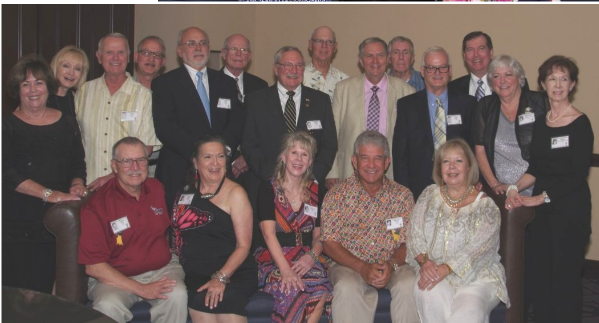
CLASS OF 65