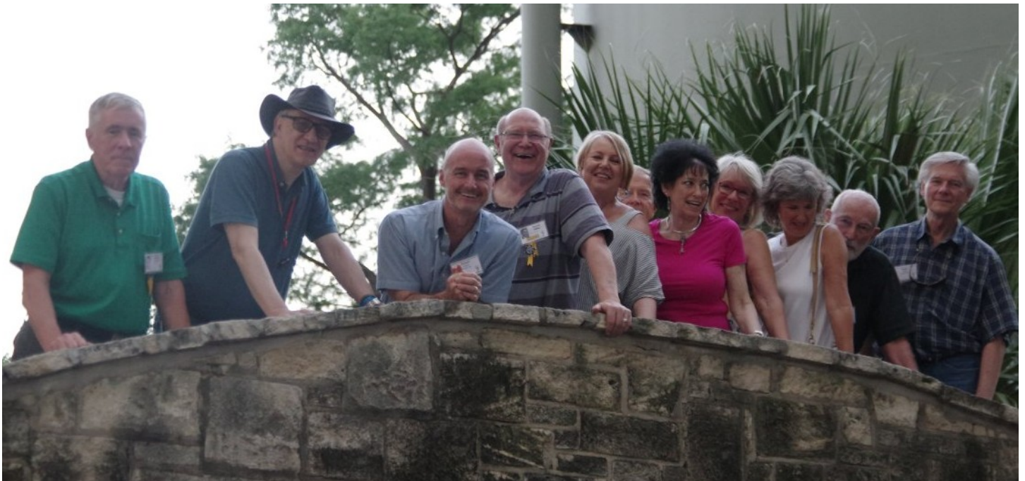
ON THE RIVERWALK