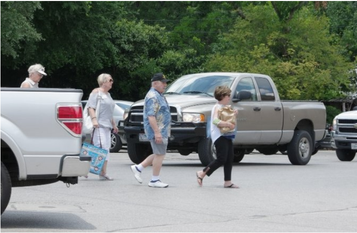
TAKING THE BOOTY TO THE BUS!