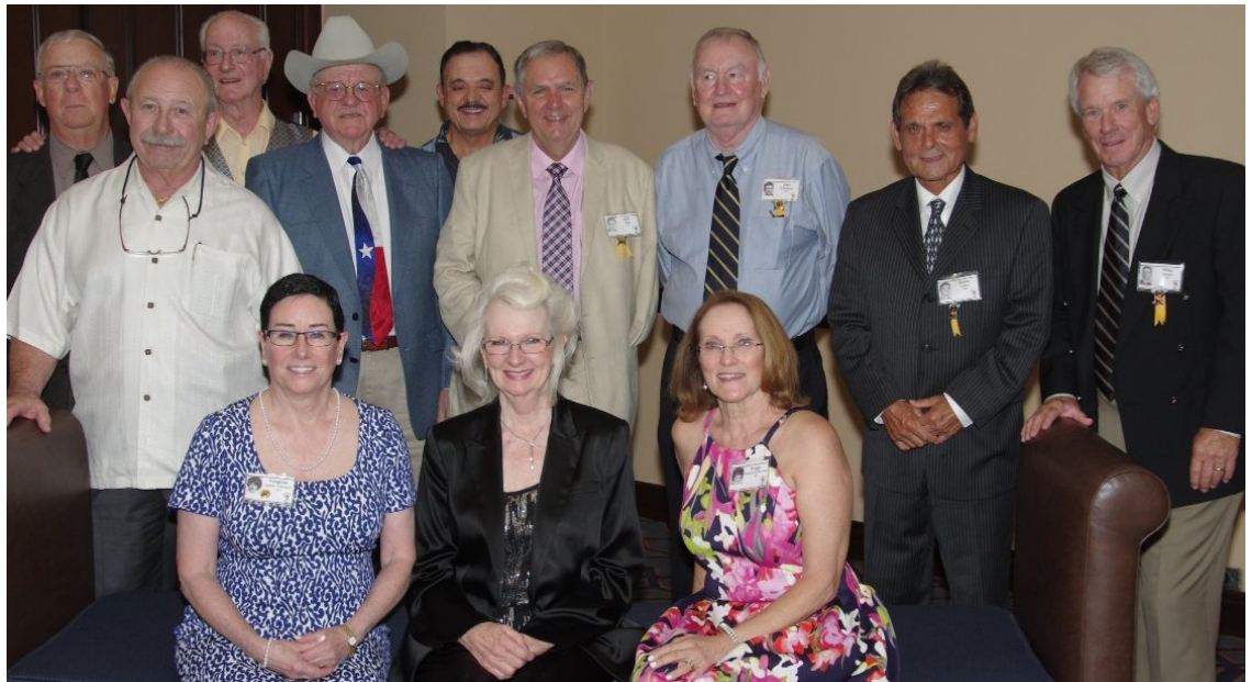
CLASS OF 64