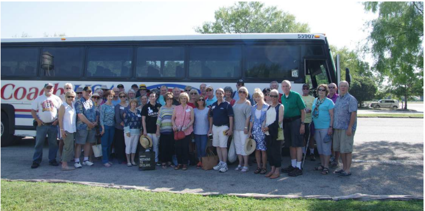
ROAD TRIP TO GRUENE