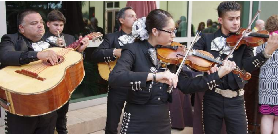
MARIACHI BAND PLAYED ON PATIO DURING COCKTAILS AND BEFORE DINNER