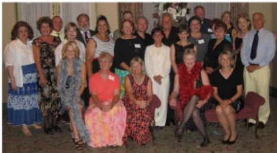
Spouses & Significant